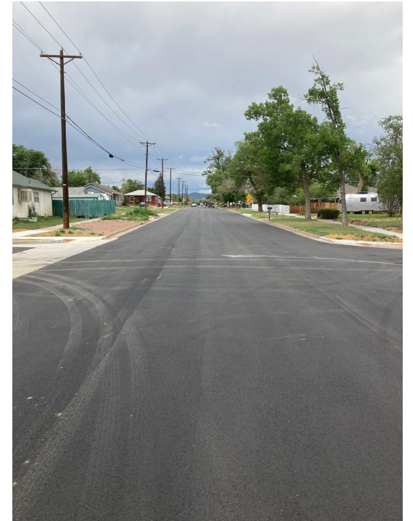
N. 8th St