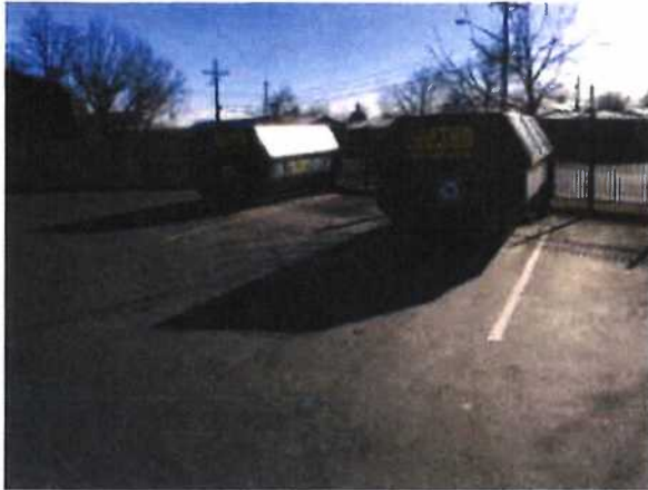
Waste Connection Providing Containers